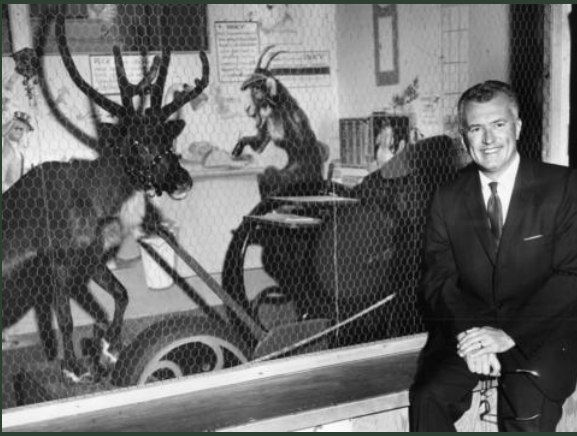
Holland and the Pixie Press animals