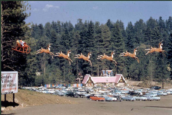
The Welcome House circa the 1950's