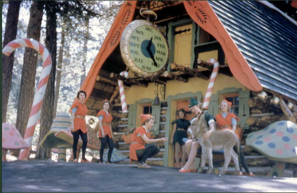
Santa's House circa the 1950's